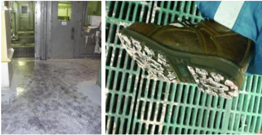
Paint Overspray and Paint Tracking Damage

Product: BoothSaver™ 2029 Boot Saver Film provides a quick, cost-efficient method for controlling dirt seed contamination and paint-tracking in the paint booth. This adhesive film covers work boots upon entering the cleanroom areas, thereby encapsulating any dirt seeds and preventing their migration into the paint shop. It can also be used to temporarily protect the workers boots when exiting the booth, to eliminate paint tracking. Perforations eliminate the need for knives or scissors. These covers are fiber-free and paintshop safe.